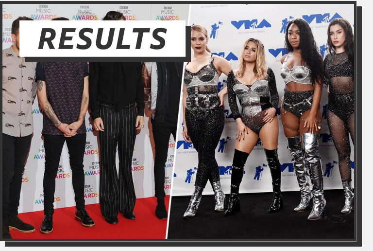
Which pop group do you miss the most: One Direction or Fifth Harmony?