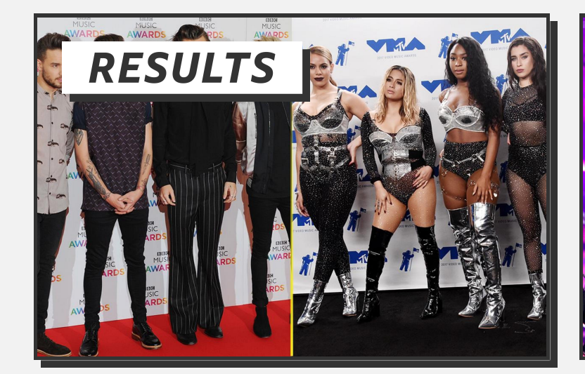
Ultimate Pop Group Fan Army: Directioners or Harmonizers?

Favorite pop-rock boy band: The Vamps or 5 Seconds of Summer?