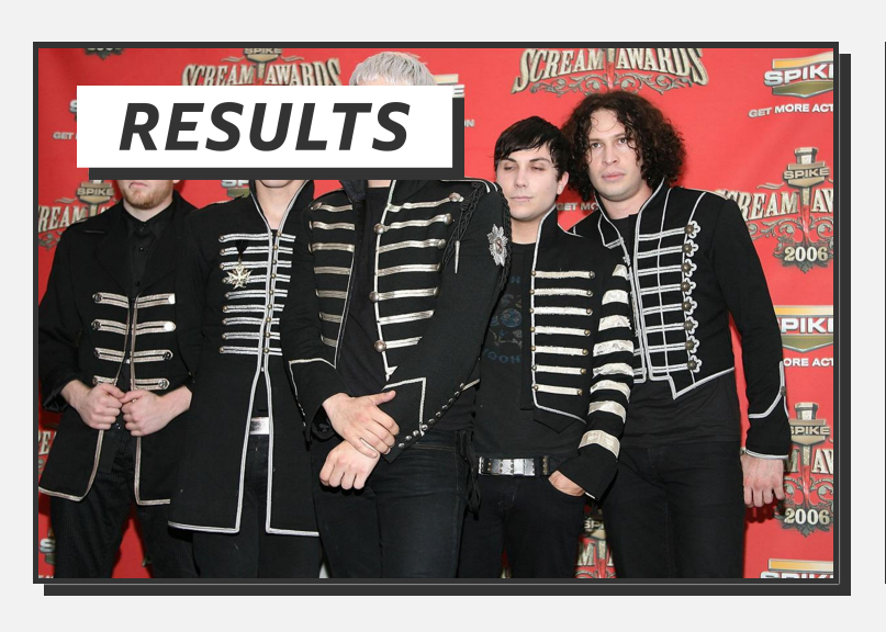
Are you stoked or indifferent toward a My Chemical Romance reunion?