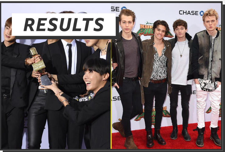
Best boy band of 2017 so far: BTS or the Vamps?