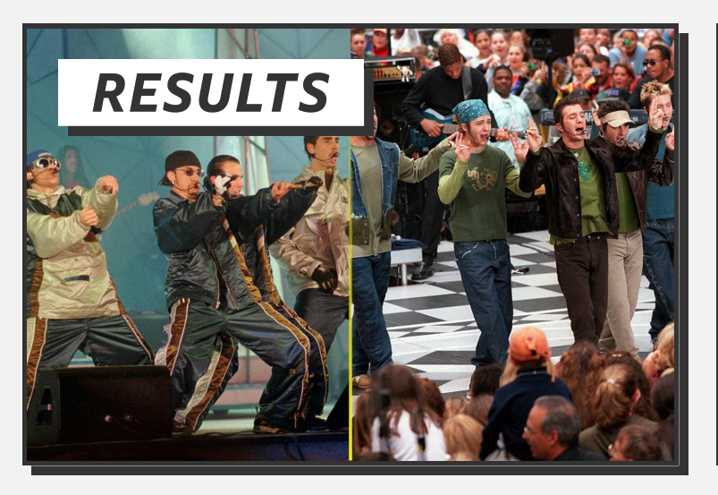
ENTERTAINMENT Most iconic '90s boy band: Backstreet Boys or NSYNC?